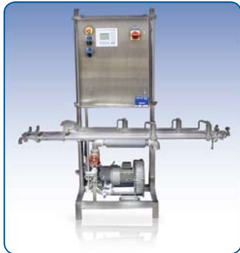
Complete unit - compact design can be adapted to any coating drum or conveyor system.